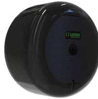
REF: CP-3000-BL Colour BLACK