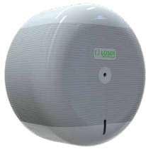
REF: CP-3000-B Colour WHITE