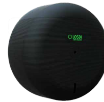
REF: CP-3000-MT Colour BLACK MATT